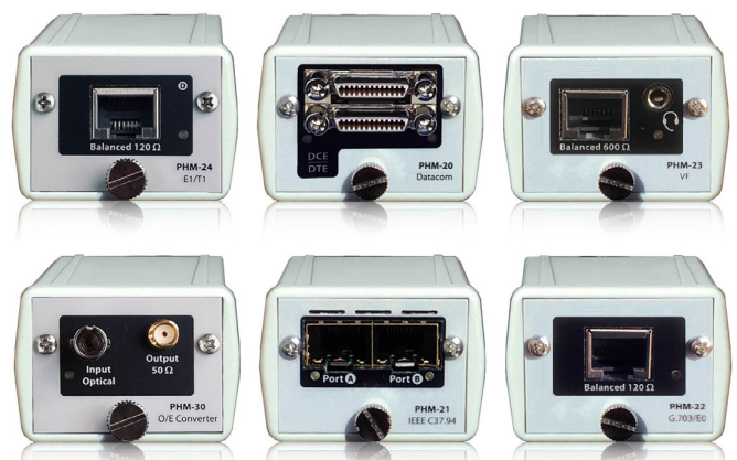
Fig3. Modules for IRIG-B, Datacom, C37.94, Codirectional, VF...

xGenius is equipped with a unique technology that ensures packet capture of selected flows and then save them in PCAP format of live traffic in full duplex mode. You can overcome most of the limitations of capture devices, firewalls, protocol analyzers running on Laptops or PCs.